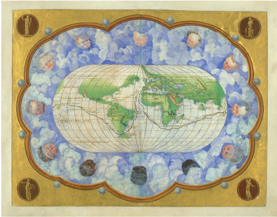
Fig. I.2: The sixteenth-century Spanish imperial world remained centred on the Mediterranean even after the conquest of the Americas. Battista Agnese, Map of the World, c. 1540s. Manuscript album, 27 x 34 cm.

This volume’s case studies of mobile communities therefore invite readers to reconsider the interconnectedness of early modern Habsburg Empire(s). In its capacity to connect and divide cultural spheres, the Mediterranean linked and separated also the Spanish- and German-speaking cultural realms of the Habsburg empire(s). This volume’s focus on the Habsburg Mediterranean, thus, engages with three branches of methodologically stimulating studies: first, Mediterranean Studies and oceanic histories; 73 second, research on the “connected histories” of the Iberian Habsburg world; 74 as well as, third, with the recent debate on globalising