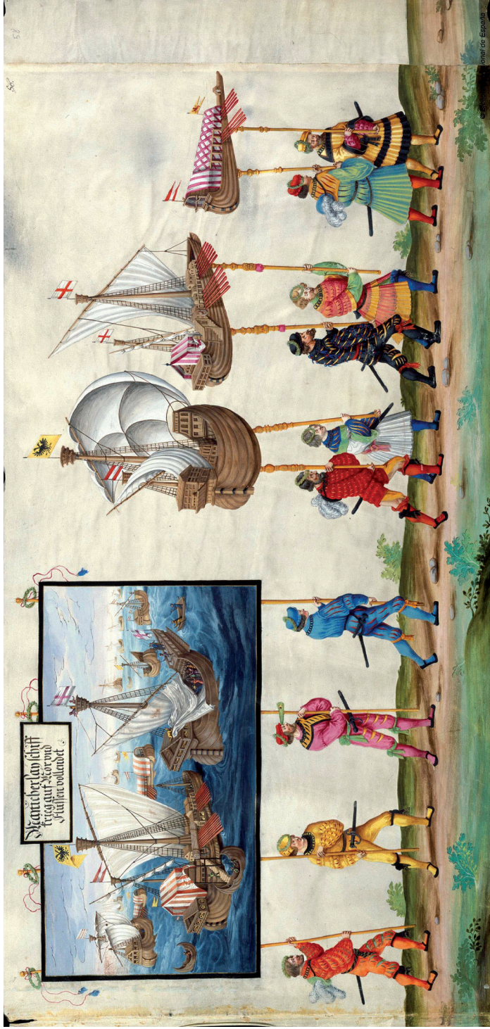
Fig. 1.1: German mercenary soldiers carrying a banner praising Habsburg naval victories during a procession at the time of Maximilian I. Anon., Triunfo del Serenísimo Poderosísimo é invicto Emperador Romano Maximilian I. de este nombre en el arbol Austríaco (...) , sixteenth century. Pictorial album. BNE, Res/254, no. 64.